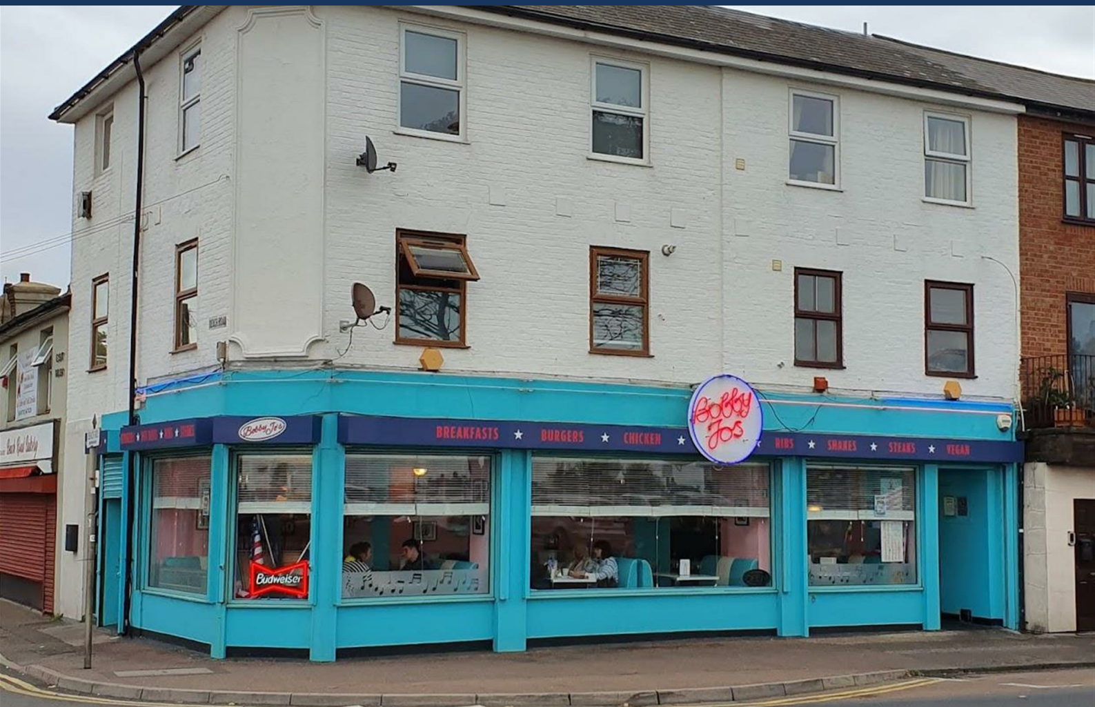
Bobby Jo's Diner, Eastern Esplanade, Southend-on-Sea SS1 2ER

To Let by way of lease assignment & premium sale